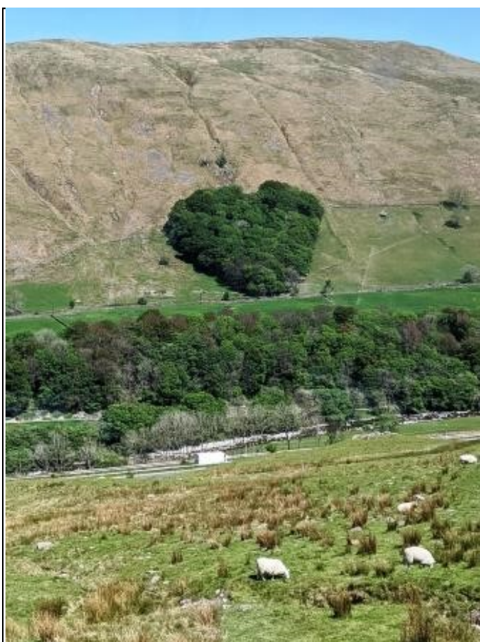
The Heart Wood taken from the top of a Classic Coach trip returning from Kendal recently.